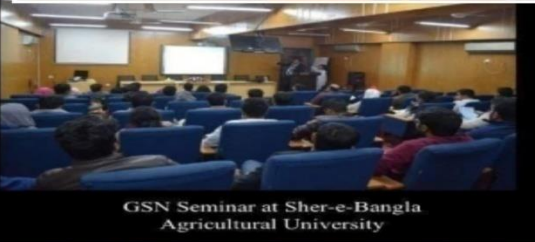
GSN Seminar at Sher-e-Bangla Agricultural University