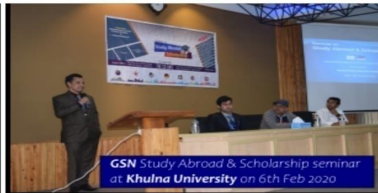
GSN Study Abroad & Scholarship seminar at Khulna University on 6th Feb 2020