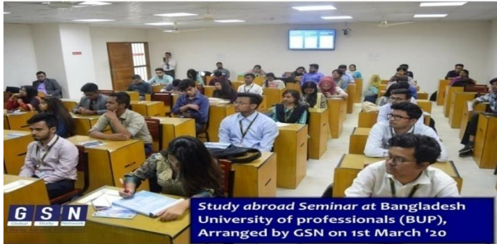
Study abroad Seminar at Bangladesh University of professionals (BUP), Arranged by GSN on 1st March '20