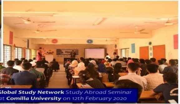
Global Study Network Study Abroad Seminar at Comilla University on 12th February 2020