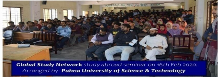
Global Study Network study abroad seminar on 16th Feb 2020. Arranged by- Pabna University of Science & Technology