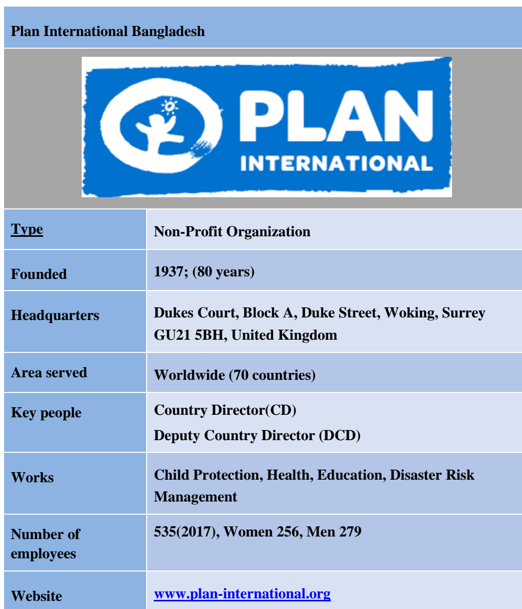
Figure: Plan’s Overview at a Glance