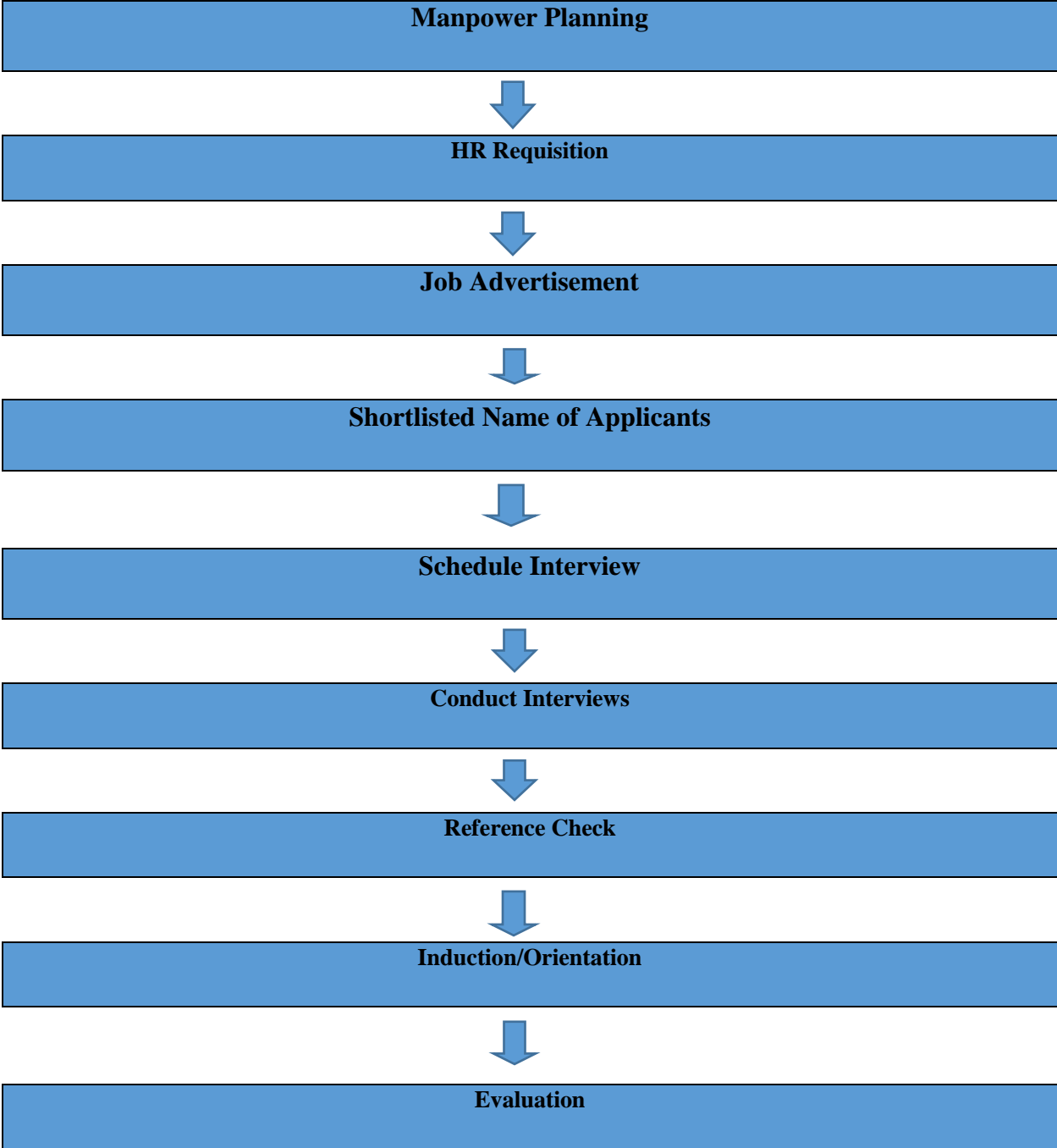
Figure: Flow Chart of Recruitment Process of Plan International